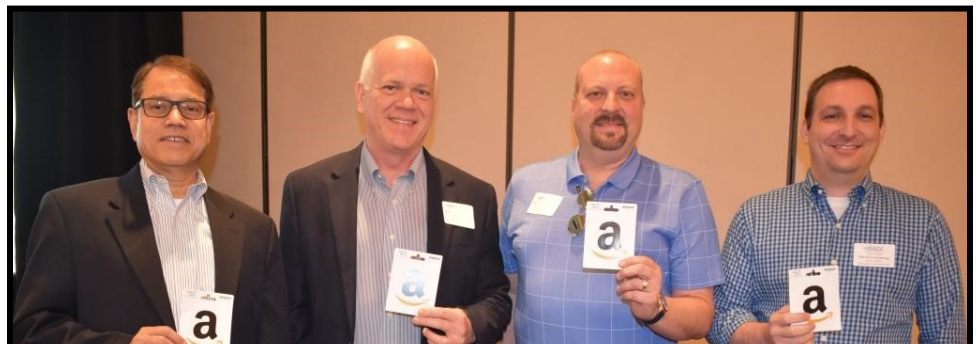
May Meeting Door Prize Winners

**Note about Presentations: ISACA North Texas can only post presentations from monthly meetings that are provided by the speaker with their permission. If a presentation is not on the website it either means we have not been granted permission or the speaker has not provided us the presentation to post yet.