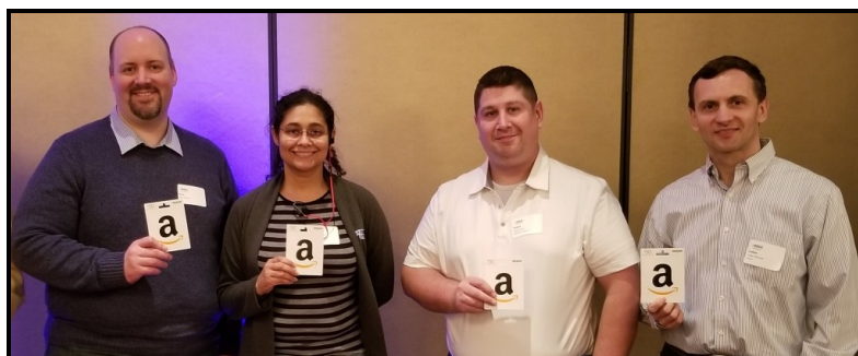
April Meeting Door Prize Winners