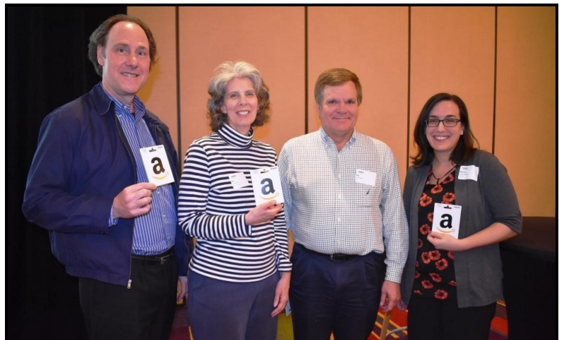
March Meeting Door Prize Winners