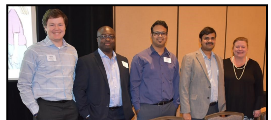
March post-lunch speakers