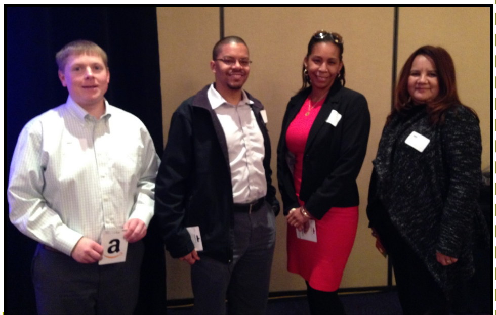
December Meeting—Door Prize Winners

**Note about Presentations: ISACA North Texas can only post presentations from monthly meetings that are provided by the speaker with their permission. If a presentation is not on the website it either means we have not been granted permission or the speaker has not provided us the presentation to post yet.