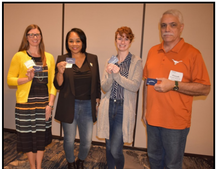
October Door Prize Winners

**Note about Presentations: ISACA North Texas can only post presentations from monthly meetings that are provided by the speaker with their permission. If a presentation is not on the website it either means we have not been granted permission or the speaker has not provided