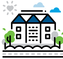
CIVIC & COMMUNITY