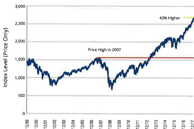
FIGURE 4 Equity Valuations Have Risen Steadily for Nine Years S&P 500 Index Price Only (12/31/99-12/31/17)

While this bull has run freely for years, it hasn't been immune to occasional corrections (as measured by a loss of 10% or greater) to help keep it healthy. Like speed limits on highways, market corrections are a necessary evil in investing, but not one to be feared. They keep markets from becoming overinflated and prevent valuations from reaching heights that lead to damaging crashes. They can also provide opportunities for active management, as we'll explore next.