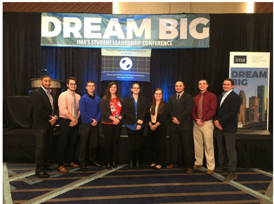
Students from Hiram College attended the IMA Student Leadership Conference in Houston from November 9 through the 11 th .