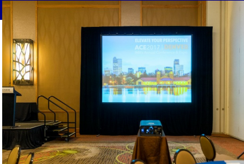
Annual 2017 IMA conference was held in beautiful downtown Denver