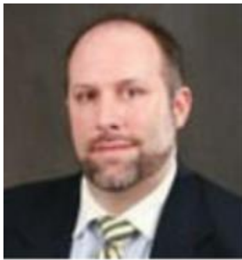
2022 Carl Menconi Ethics Case Competition Winner

Registration: https://event.on24.com/wcc/r/4008002/A2B5E48E72E62404DA041A921122715D