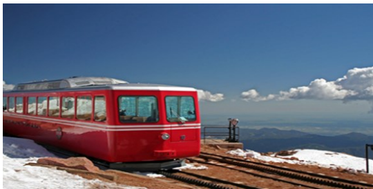
Pike's Peak Cog Train

Registration must be received by October 8, 2015. Should you need to cancel your registration, request for refunds must be submitted in writing by October 8 and will be honored subject to a $25 administrative fee. Please remember to cancel your room reservation directly with the hotel. Refunds cannot be made after October 8.