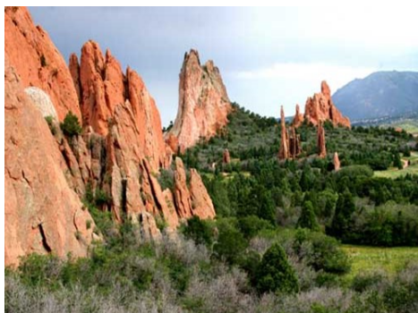
Garden of the Gods