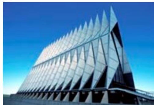
Air Force Academy

Please see next page for additional information