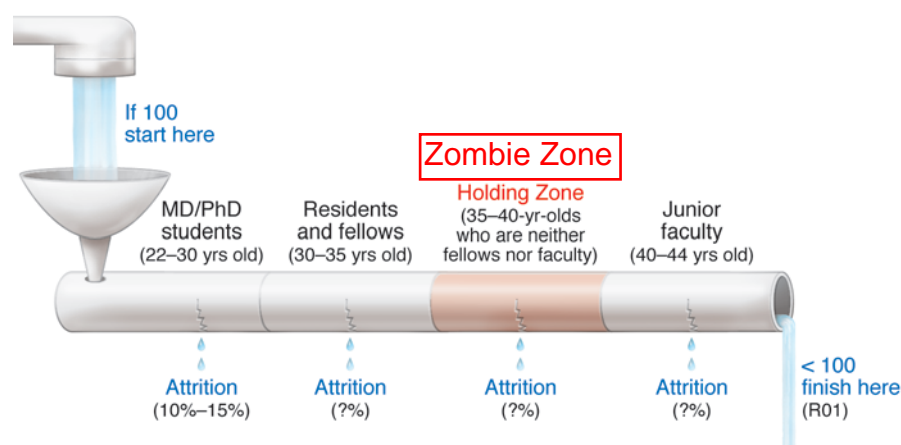
Figure 1. The physician-scientist pipeline: long and leaky. The figure highlights a number of issues, including career attrition at every stage and the existence of a protracted period when well-trained physicians in their 30s are serving in subordinate positions awaiting the next step in their career progression. To draw attention to their plight, we call this period the holding zone. The illustration is based on the experience of MD-PhD program graduates, but many of the issues reflect the obstacles for any would-be physician-scientist. Attrition rates from MD-PhD programs are low, with most of those who withdraw completing medical school or graduate school. Very few MD-PhD program graduates (5% or fewer) choose to forego postgraduate clinical training as residents and fellows. In our experience, career attrition takes many forms and becomes cumulative at each stage, reflecting the proportion of individuals who either never return to research, opt for full-time clinical practice outside of academia, join academia as an assistant professor but spend their time caring for patients, or are appointed to the tenure track but end up devoting minimal time to research (1). A declaration of success depends in part on the definition of success. Outcome data show that approximately 80% of MD-PhD program graduates are working in academia, industry, or research institutes – including the NIH – but not all are doing research (3). Data on NIH award rates, conversions from K grants to R grants, and the proportion of individuals appointed to MSTP T32 grants can be found in the PSW report (1). The NIH continues to track principal investigators on grants but is just starting to track physician-scientists who play essential roles as other key personnel.

led. Our action plan focuses on four ideas that can be implemented now to sustain the PSW: (i) apply lessons from the MD-PhD training experience to postgraduate training; (ii) shorten the time to independence by at least 5 years; (iii) achieve greater diversity and numbers in training programs; and (iv) better organize physician-scientist mentoring and oversight at all levels to reduce attrition. We note that much of this can be accomplished without new funds from the NIH, but we urge that the goals be addressed through a partnership between the NIH, national clinical and medical organizations, and academic medical institutions.