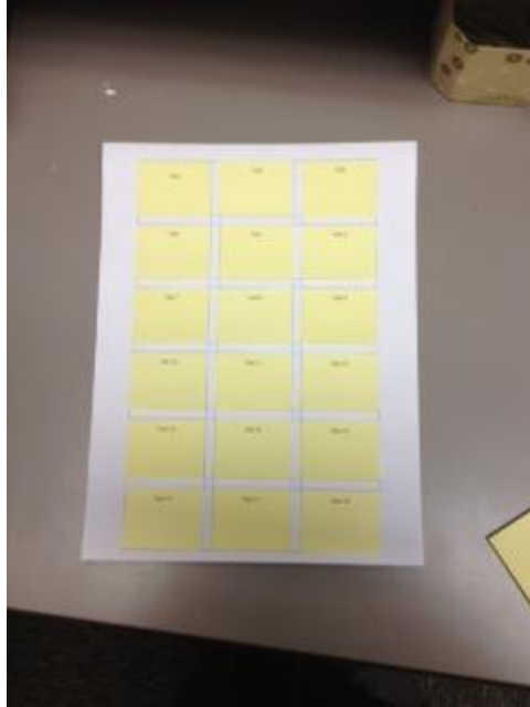
(Finished template ready for print)