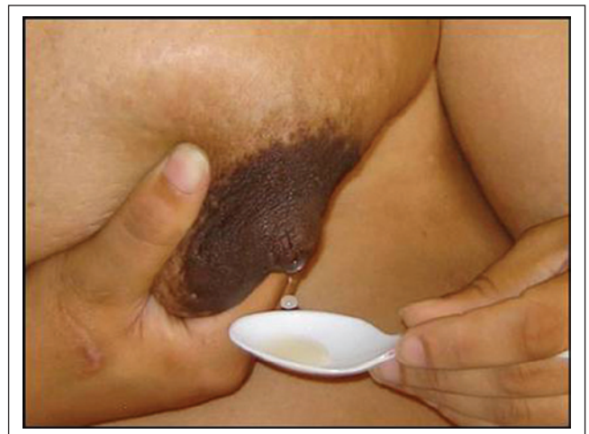
Hand expression of colostrum (early milk) in first 3 days