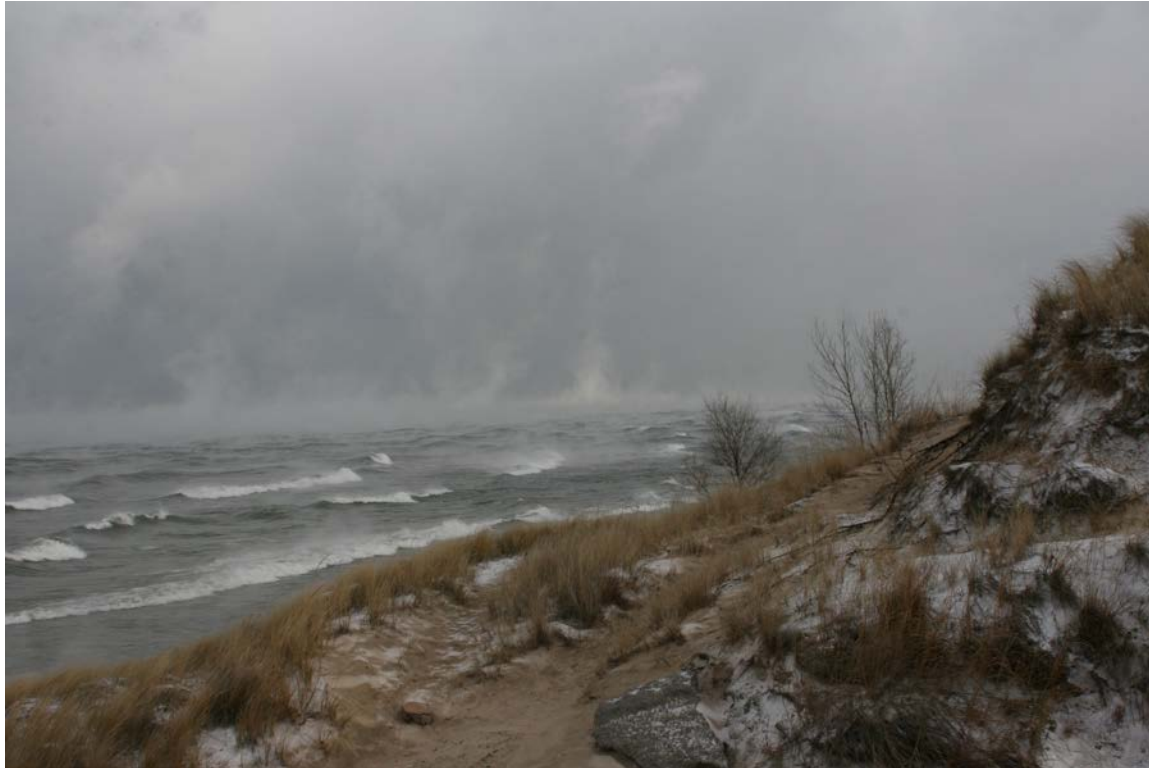
Whipping Waves of Lake Michigan