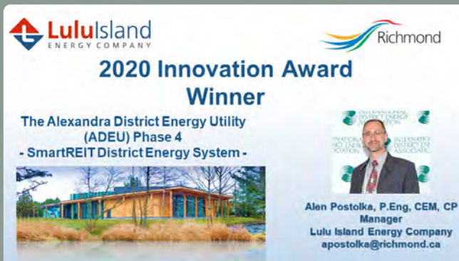
Lulu Island Energy Company received the 2020 Innovation Award in a virtual awards event on December 16, 2020.

To enter , please complete the form on the following page and email your completed submission as a PDF to idea@districtenergy.org with the subject line: “2024 Innovation Award” by the deadline of Friday, April 12, 2024. If you have questions, please contact IDEA at +1-508-366-9339 or visit http://bit.ly/InnovationAwardIDEA .