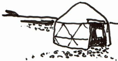
YURT - gravel