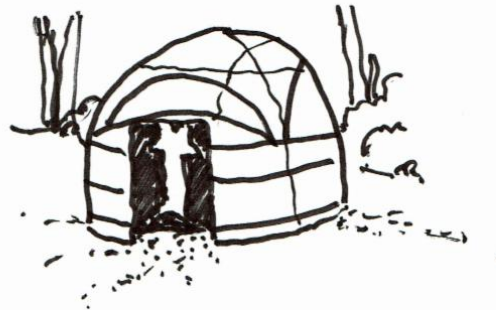
WIGWAM - dirt