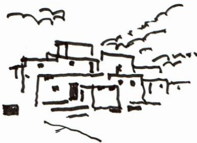
PUEBLO - mud