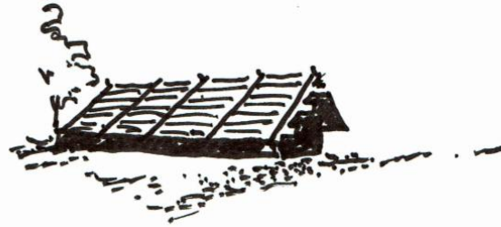
PLANKHOUSE - bark