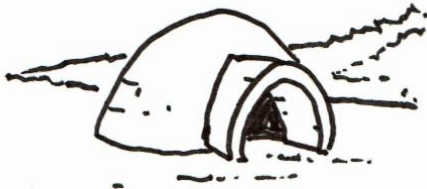
IGLOO - ice