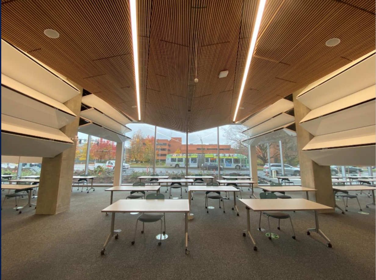
Knight Campus for the Acceleration of Scientific Impact @ U of O.