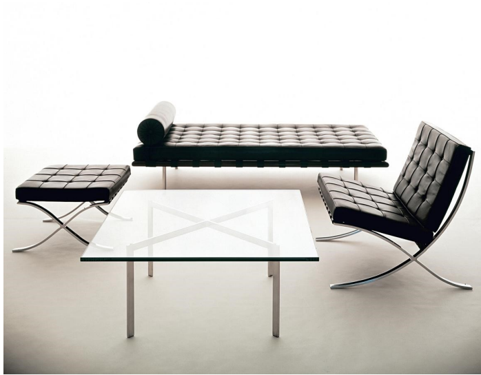
Frank Lloyd Wright - "Less is only more where more is no good."