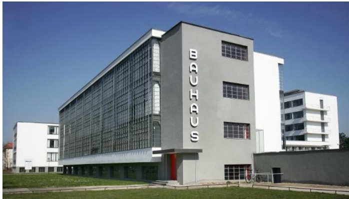
Eero Saarinen - "Function influences but does not dictate form."