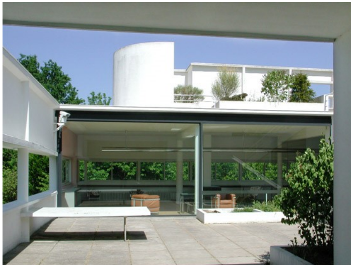
Michael Graves - "In any architecture there is an equity between the pragmatic function and the symbolic function."