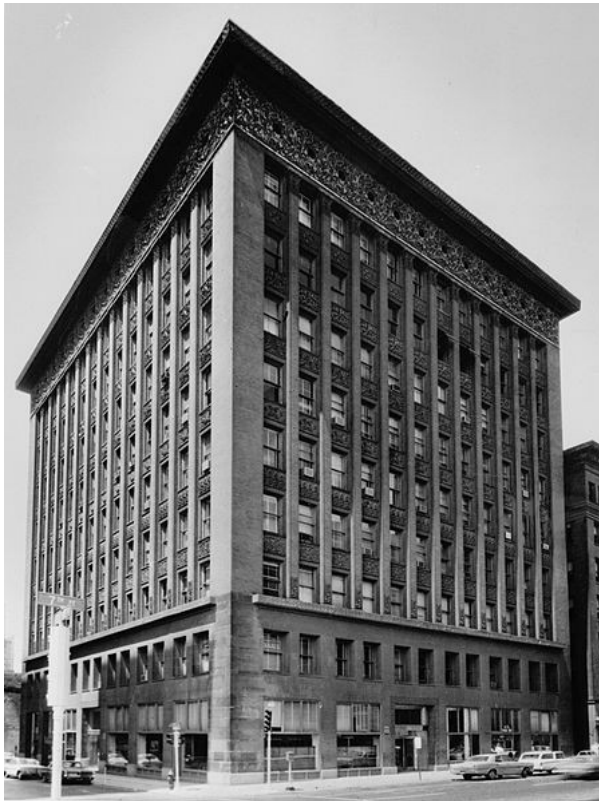
Charles-Édouard Jeanneret-Gris, better known as Le Corbusier - "The home should be the treasure chest of living."