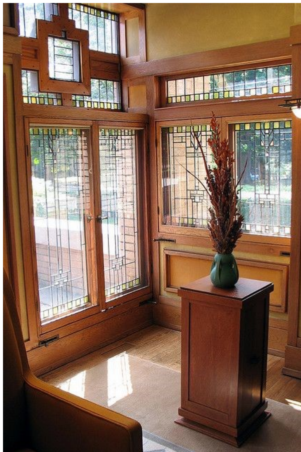
Walter Gropius - "Architecture begins where engineering ends."

March 9, 2017 Specifications: How to Write and Review Them April 13, 2017 Port of Seattle SeaTac International Projects May 11, 2017 Understanding Acoustical Design May 18, 2017 NW Region/West Region Conference June 8, 2017 Awards Program