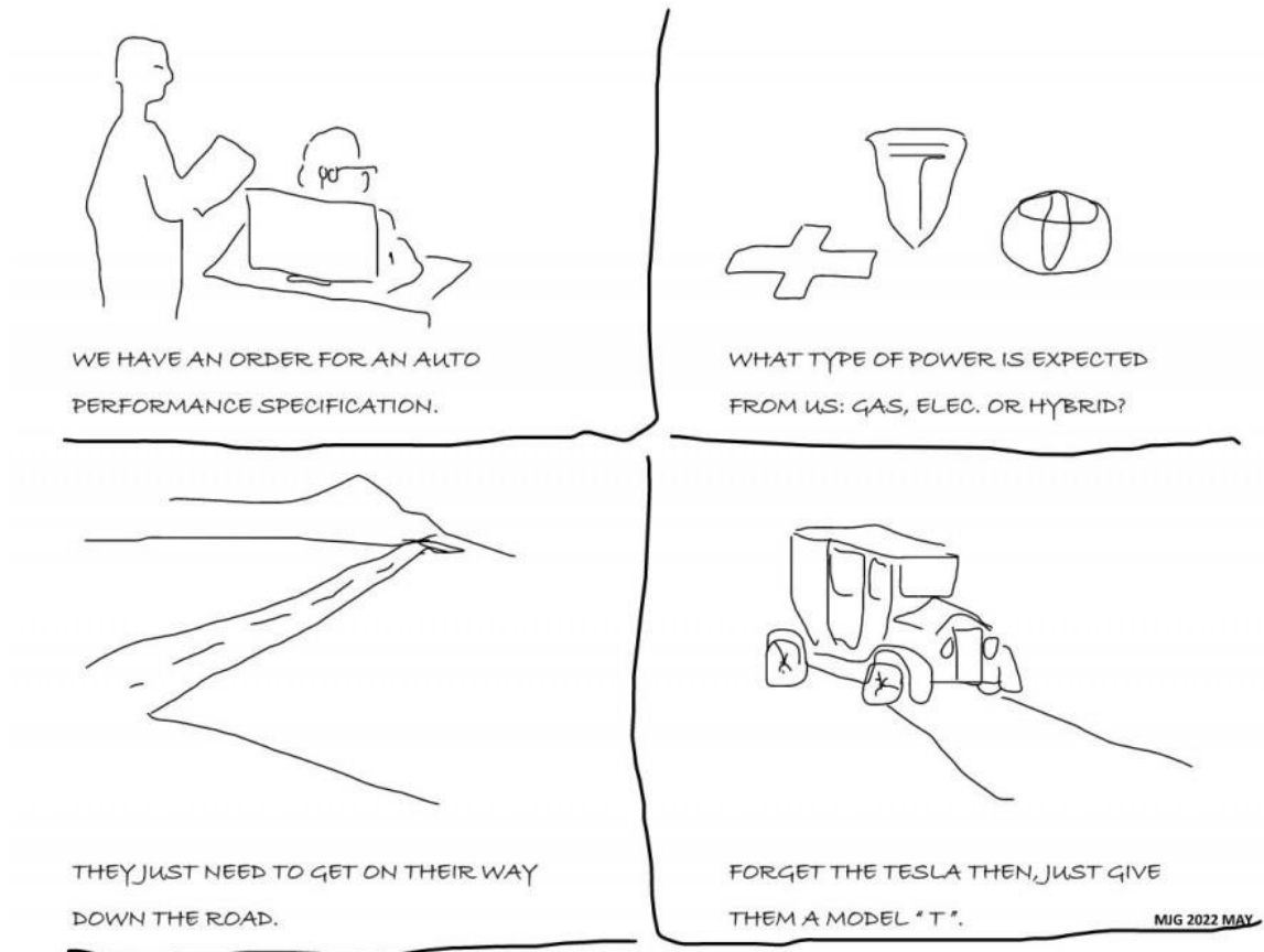
Illustration by Matt Gregory