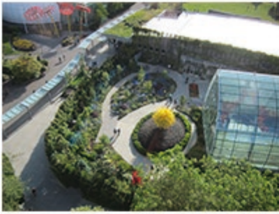
View from the Skyline Dining Room.