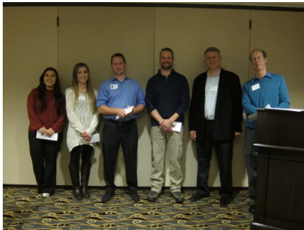
Lake Washington students are recognized for their achievements