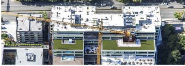
1101 Dexter installation with Firestone 30 year TPO and Firestone SkyScape Garden Roof. Contractor - Cobra BEC.