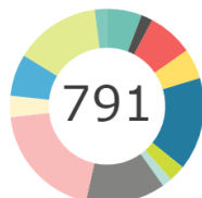
Member Affiliation Analysis - Chart

Chapter Akron-Canton Blue Grass Cincinnati Cleveland Columbus Dayton-Miami Valley Evansville Grand Rapids Indianapolis