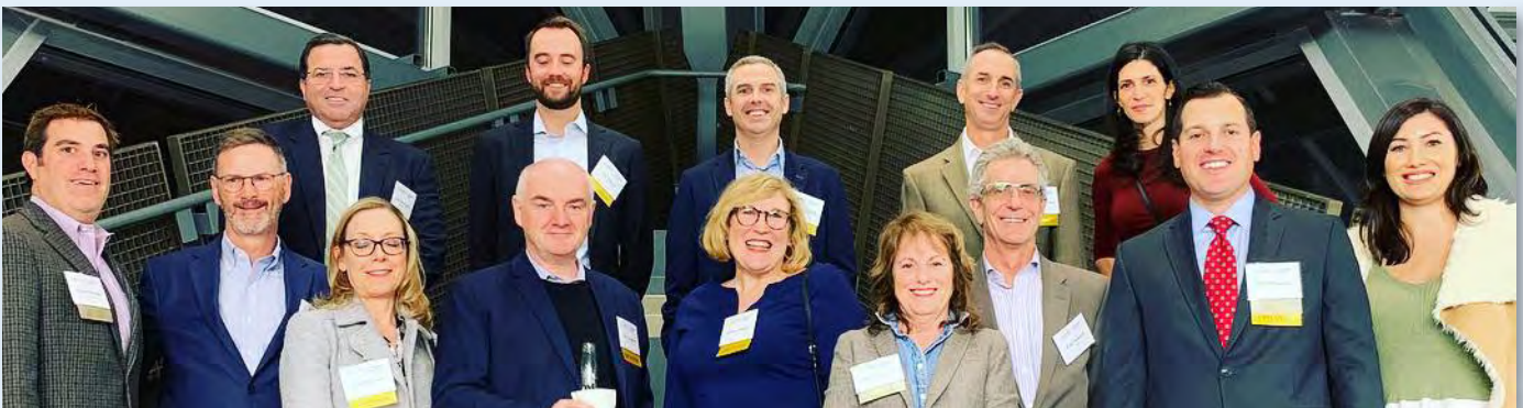
Chapter sponsors and guests in attendance

On November 13th the 2018 Annual Chapter Sponsors gathered at Pennovation for the year-end sponsor appreciation event.