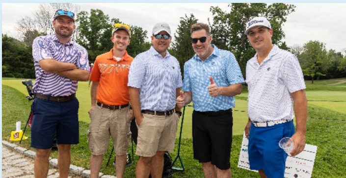
Annual Golf Outing