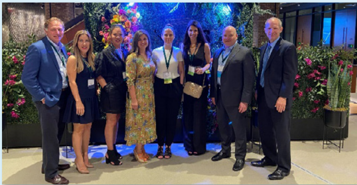
CoreNet Board Members at ERS