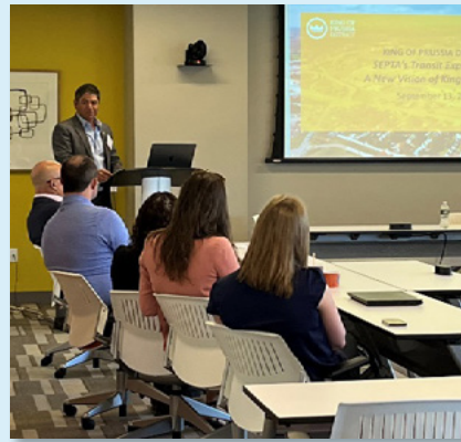
SEPTA Transit Expansion Event