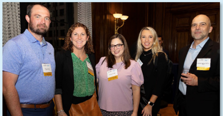
Sponsor Appreciation Sake Tasting and Fall Social