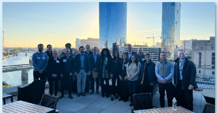
Young Leaders Amenity Crawl