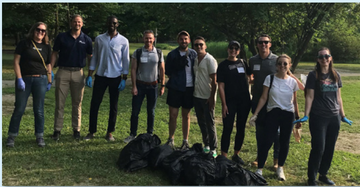
FDR Park Clean-up

Plans are underway to provide exciting learning and networking engagements throughout the upcoming year. Thank you for your continued support; let's look forward to another year of connecting and learning together.