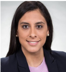
DEI LEADER OF THE YEAR