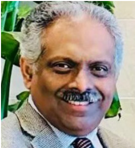
CRE EXECUTIVE OF THE YEAR