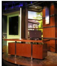
Envision Room 2