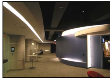
MS Tech Ctr 8