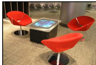
MS Tech Ctr Table 1