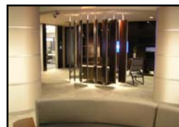
MS Tech Ctr Break Area 4