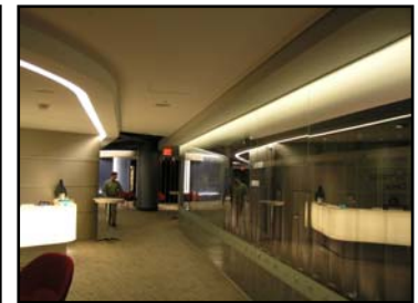
MS Tech Ctr Entry 4