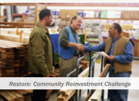
Restore: Community Reinvestment Challenge

Saturday, October 2, 2010 9:00 AM – 1:00 PM