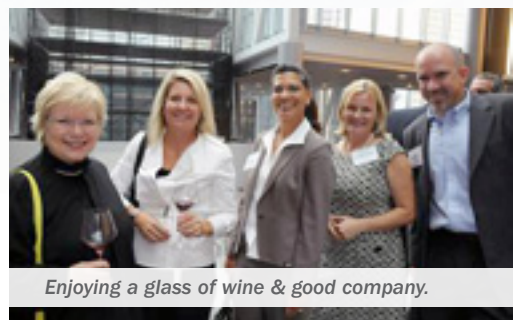
Enjoying a glass of wine & good company.