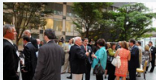
The crowd is engaged & connecting.