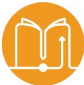
MCR or QPCR?

The corporate real estate (CRE) landscape has reached an inflection point. After years of reactive rightsizing and pandemic-driven pivots, 2026 marks the year when real estate redefines its role from a necessary cost into a strategic differentiator. Read more from JLL research.