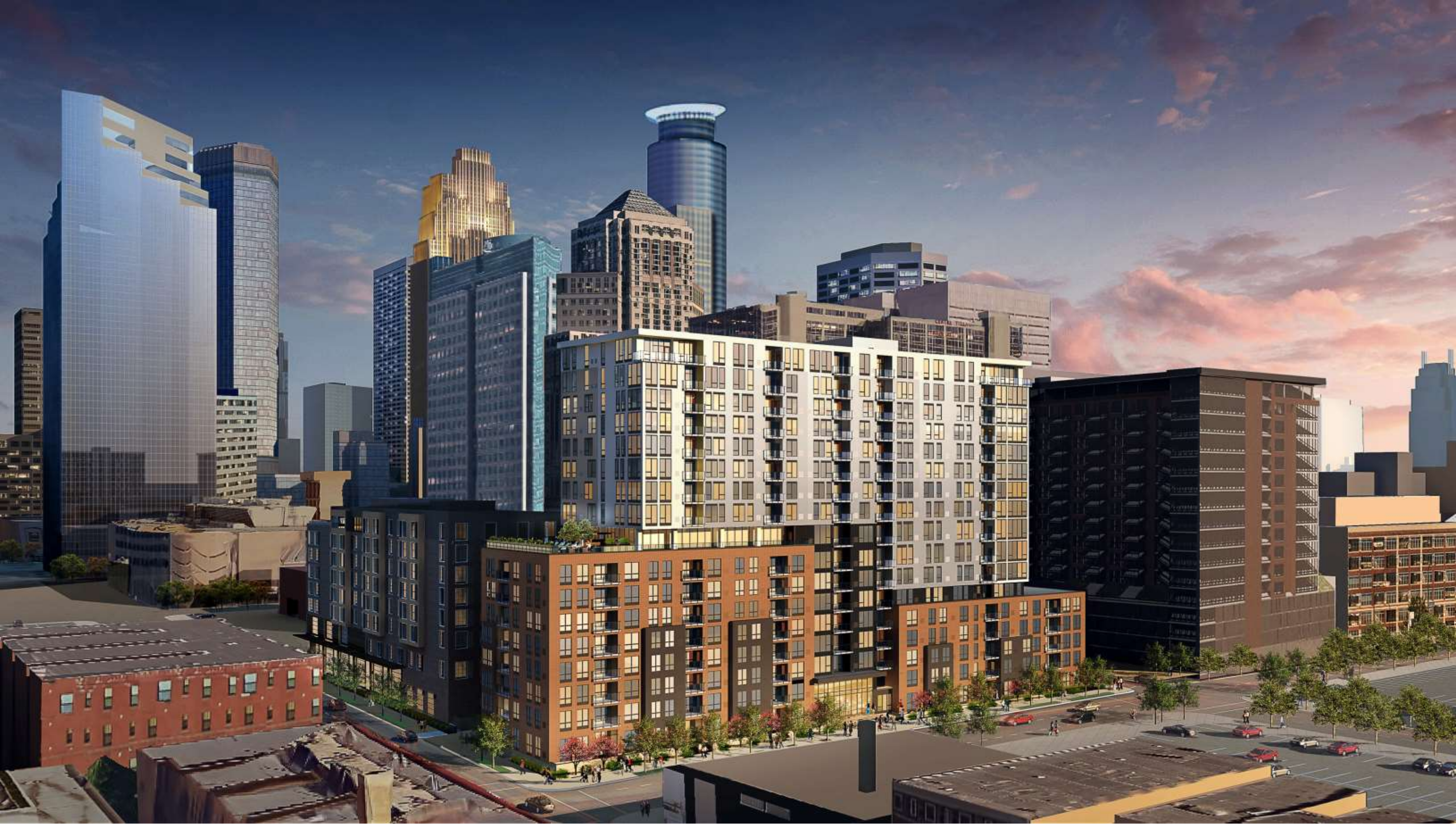
K.A. BLOCK MIXED USE REDEVELOPMENT