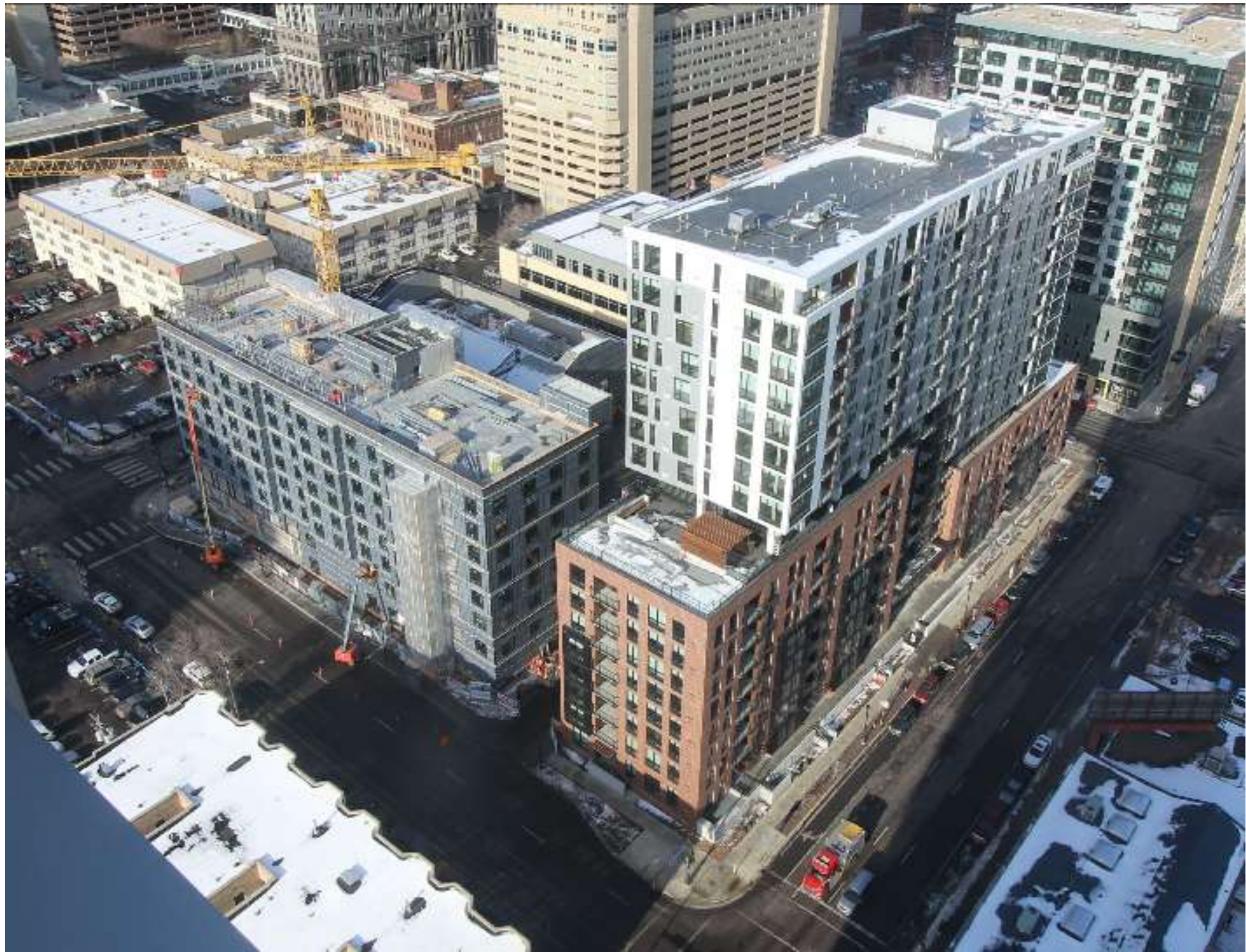
K.A. BLOCK MIXED USE REDEVELOPMENT