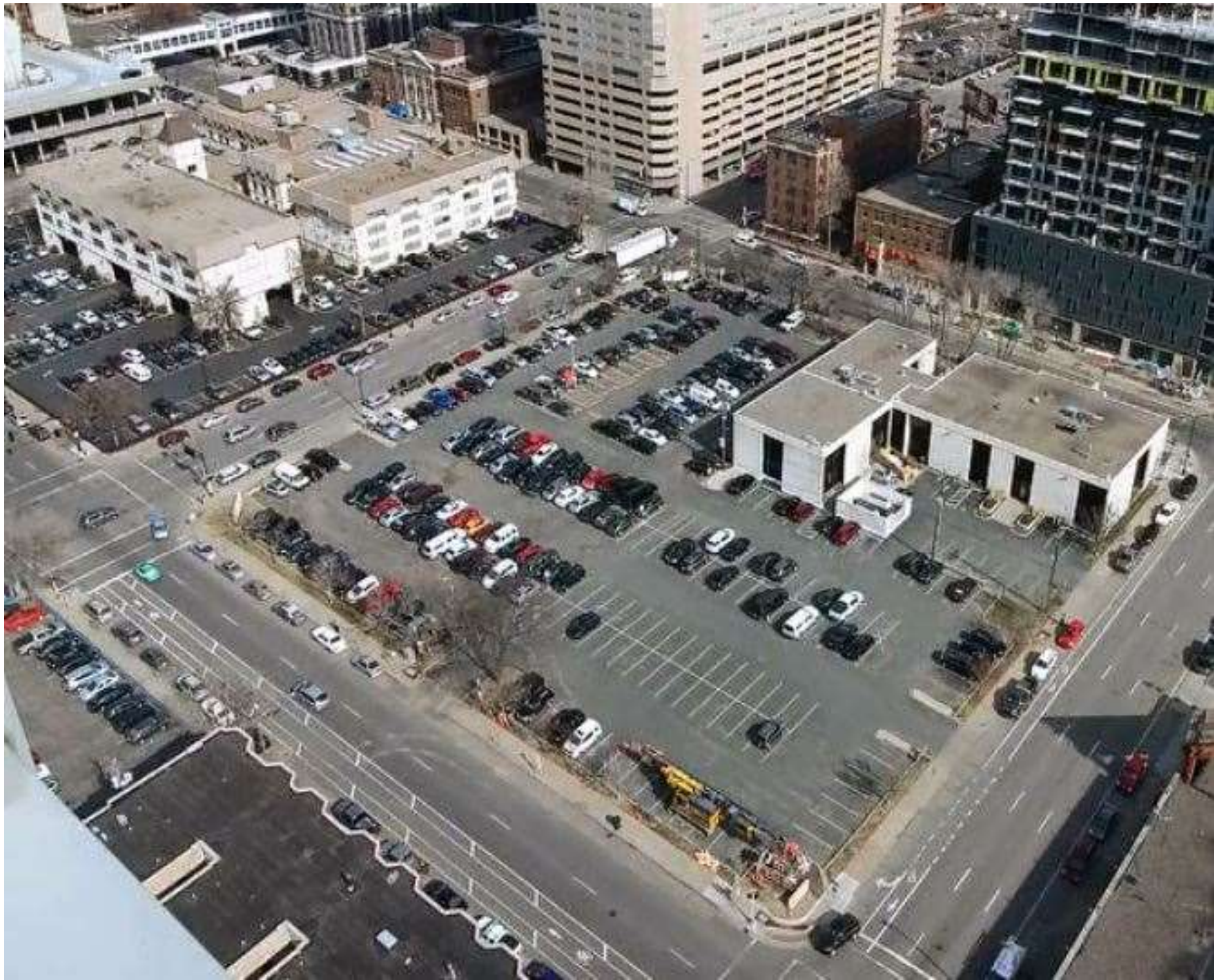
K.A. BLOCK MIXED USE REDEVELOPMENT