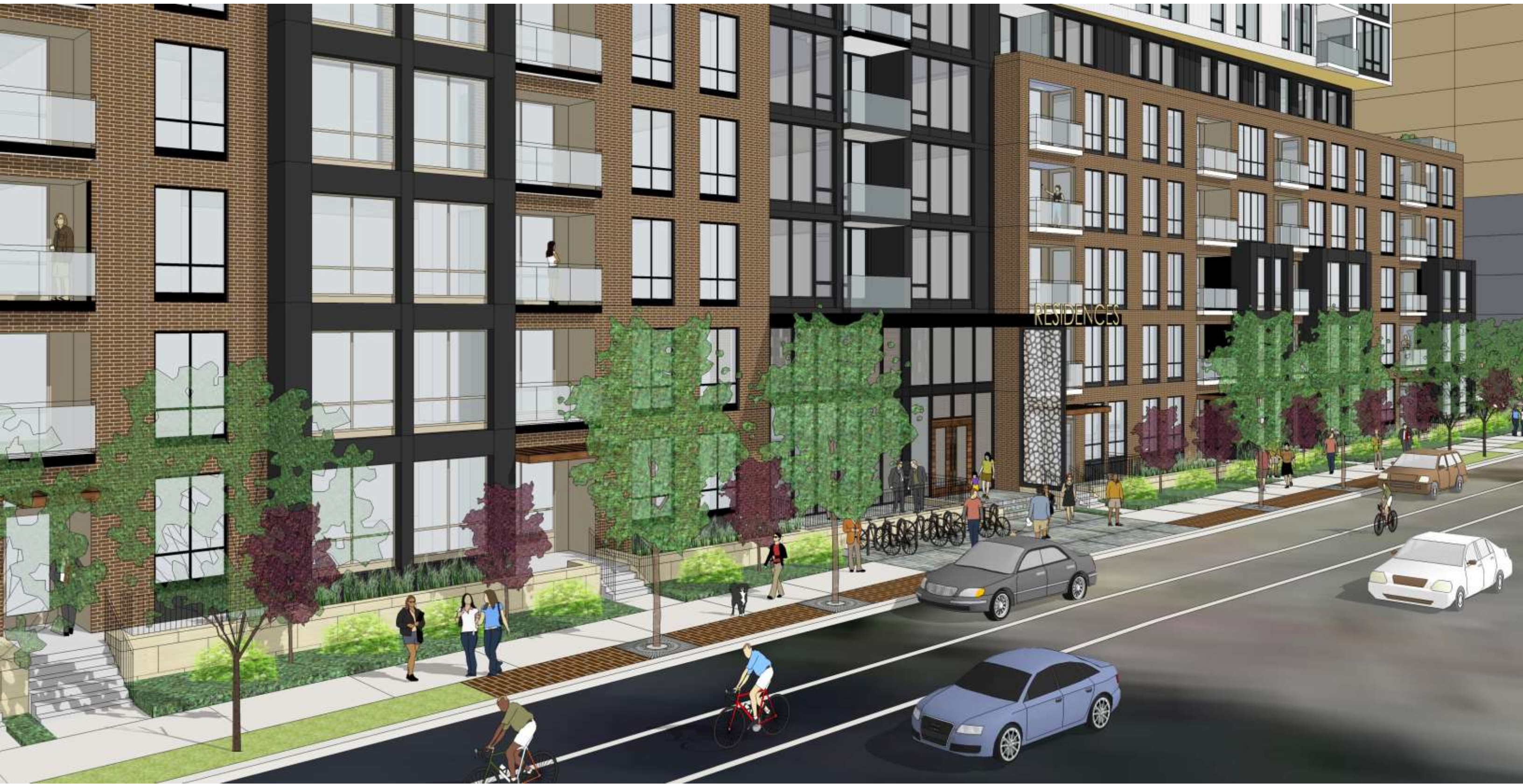
K.A. BLOCK MIXED USE REDEVELOPMENT DESIGN VISION