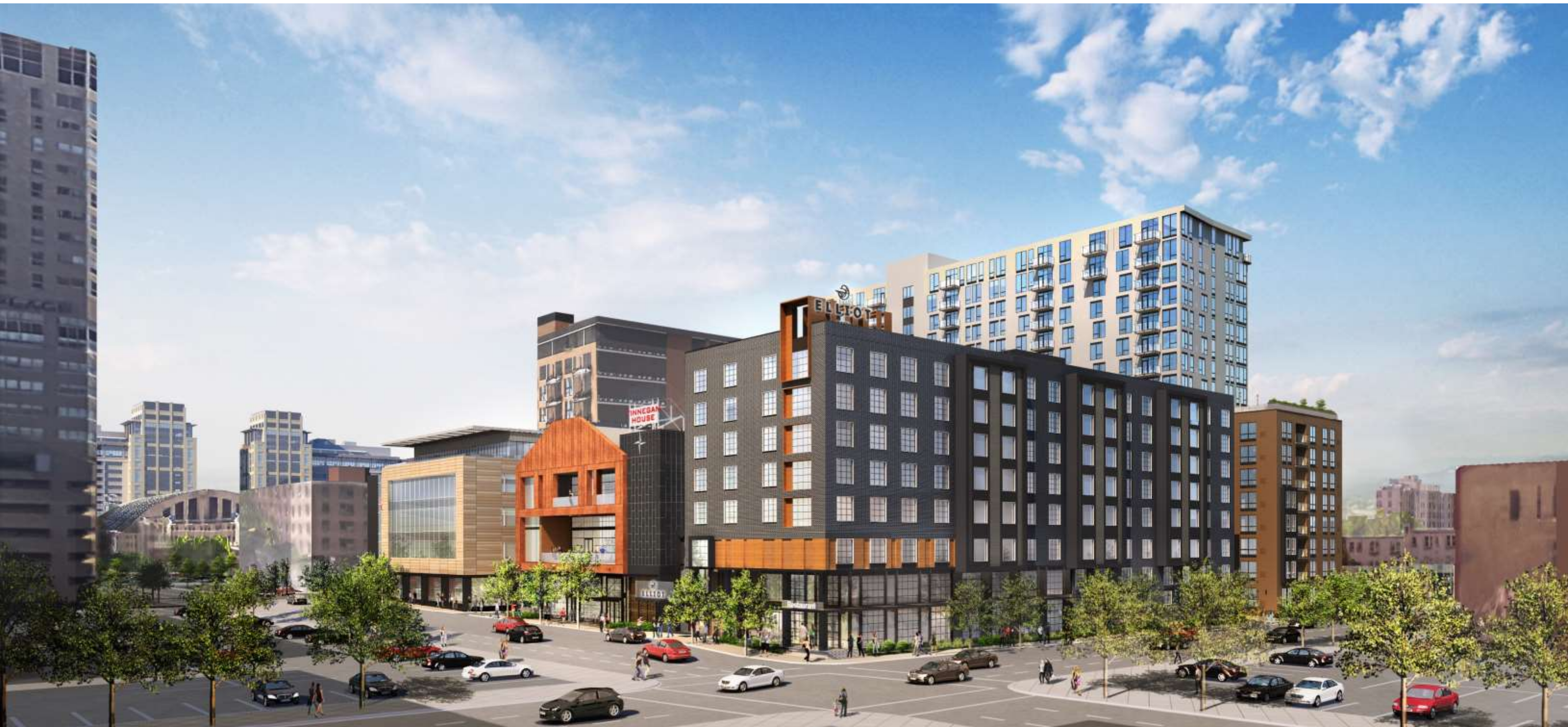
K.A. BLOCK MIXED USE REDEVELOPMENT DESIGN VISION