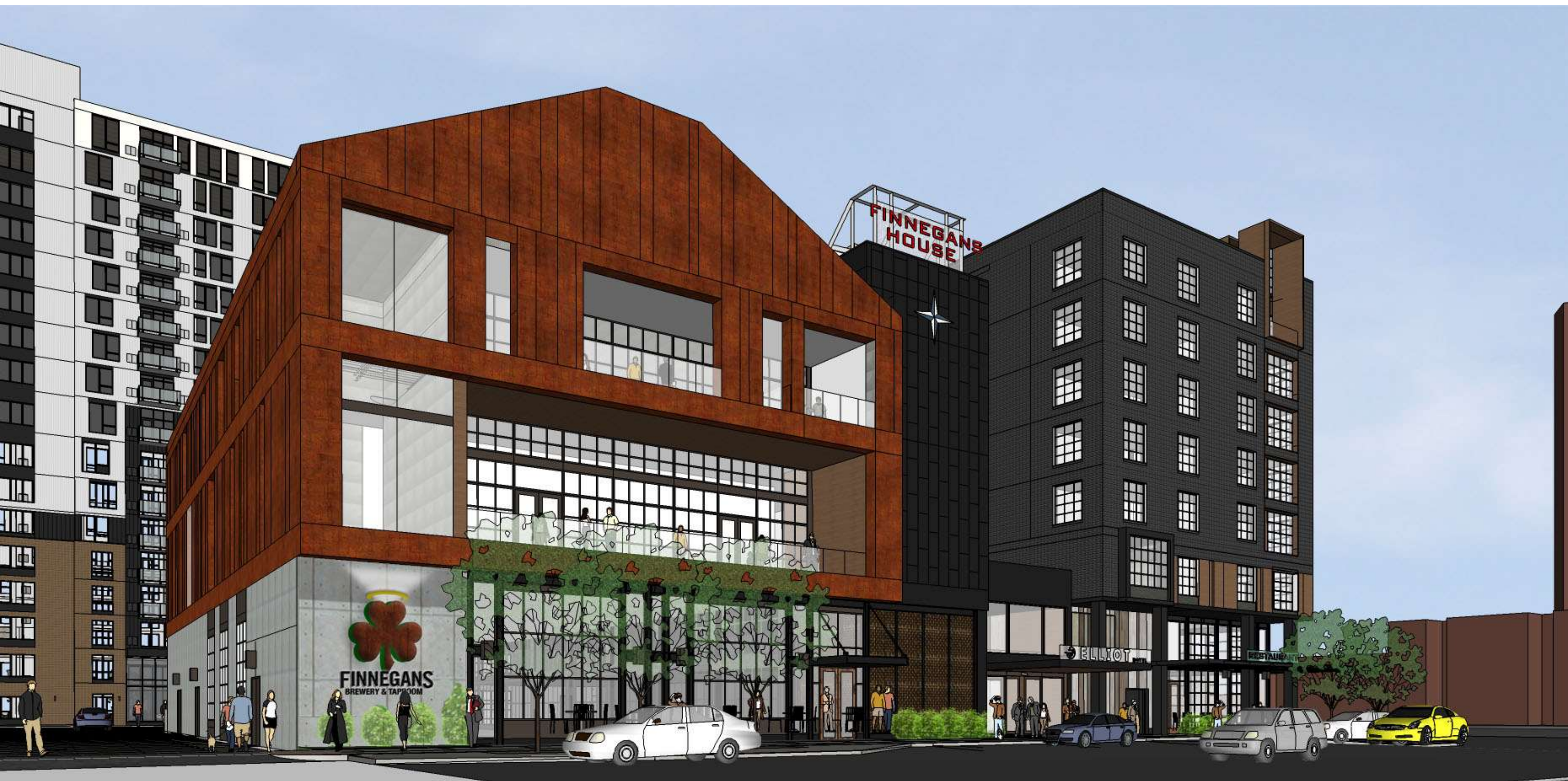
K.A. BLOCK MIXED USE REDEVELOPMENT