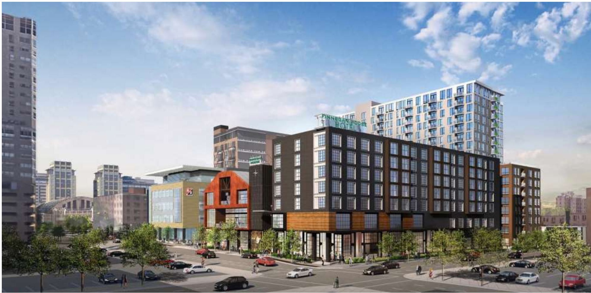
K.A. BLOCK MIXED USE REDEVELOPMENT DESIGN VISION