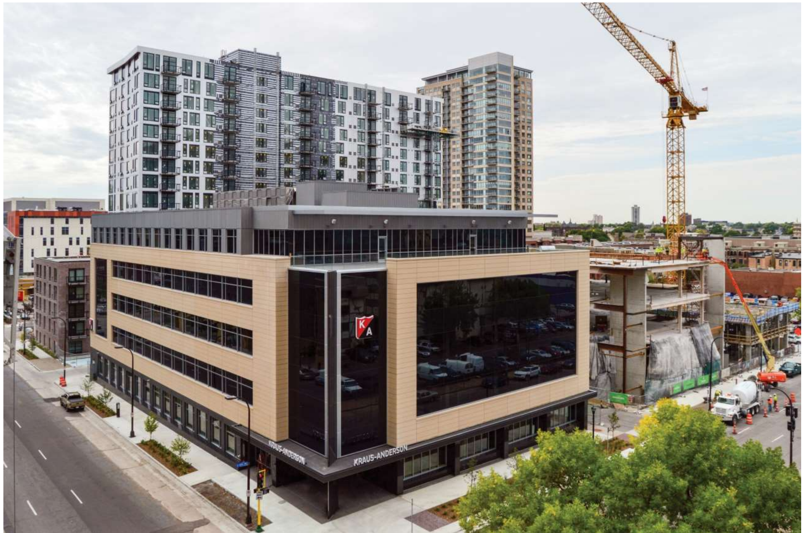
K.A. BLOCK MIXED USE REDEVELOPMENT