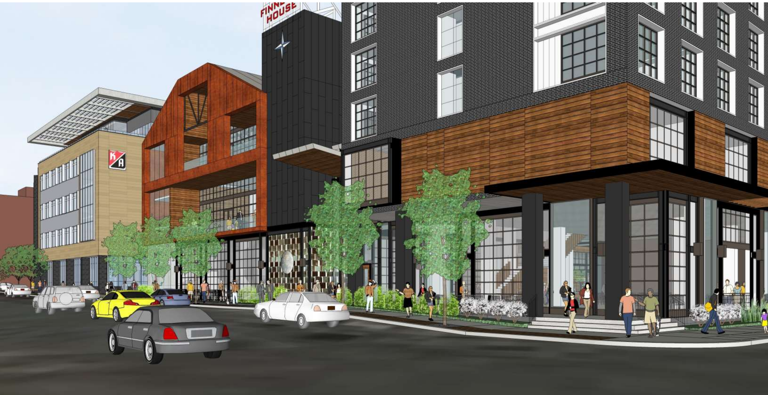
K.A. BLOCK MIXED USE REDEVELOPMENT DESIGN VISION