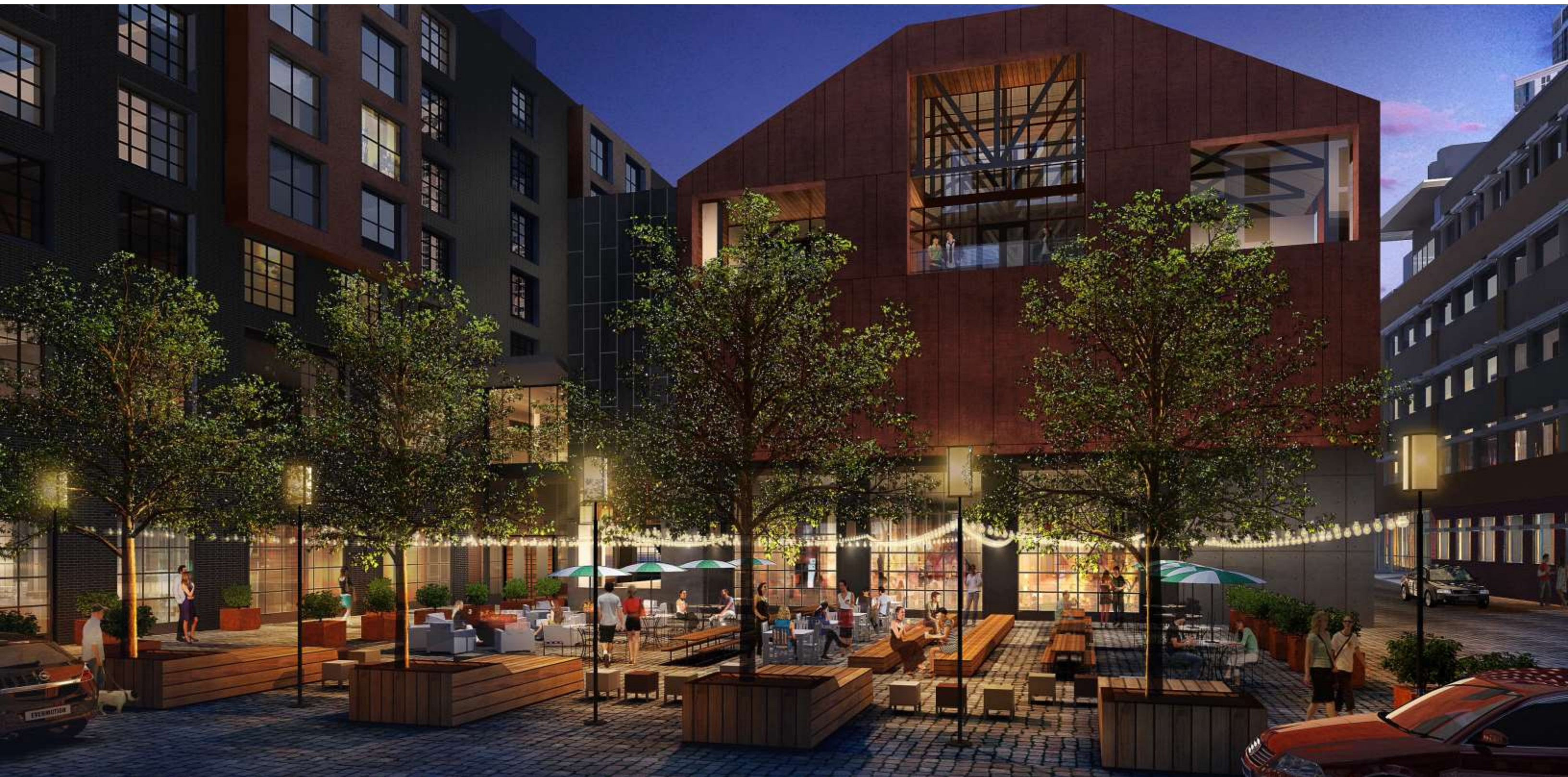
K.A. BLOCK MIXED USE REDEVELOPMENT DESIGN VISION