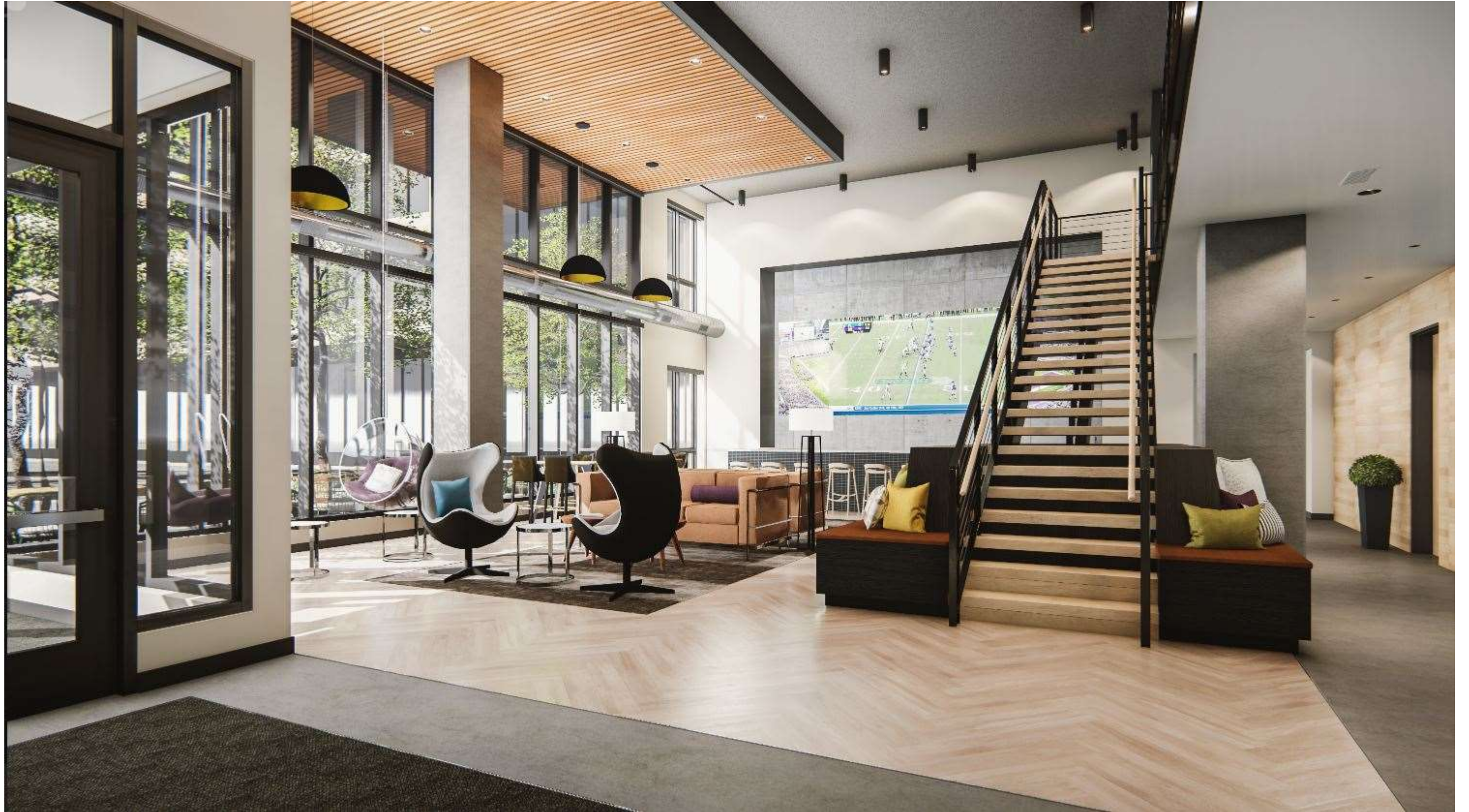
K.A. BLOCK MIXED USE REDEVELOPMENT