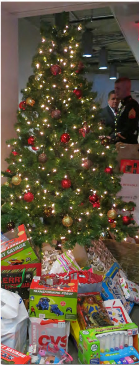
Toys for Tots Donations