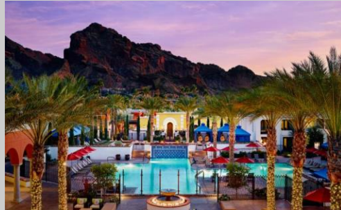
The Beautiful CEoY Venue!

Register online here for the Construction Executive of the Year Dinner & Awards that will be held on Thursday, May 4, 2017 at the Montelucia Resort. You can also download a registration form or support this event as a sponsor using this sponsorship form . Don't miss our chapter's signature event and a night to remember, celebrating our construction community!