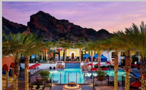
The Beautiful CEoY Venue!

Register online here for the Construction Executive of the Year Dinner & Awards that will be held on Thursday, May 4, 2017 at the Montelucia Resort. You can also download a registration form or support this event as a sponsor using this sponsorship form . Don't miss our chapter's signature event and a night to remember, celebrating our construction community!