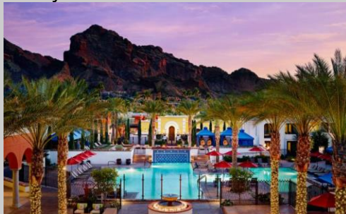
The Beautiful CEoY Venue!

Check out the event page for more exciting announcements as our four finalists will be named soon. In the meantime, get your sponsorships in before the early bird pricing ends on February 10th!