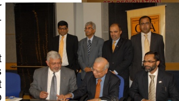
CFA— IBA University Partnership Program