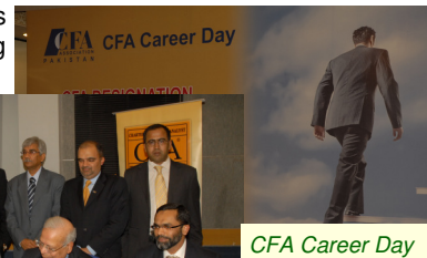
CFA Career Day

CFA Pakistan would continue to work hard to enhance image of CFA program in Pakistan. I request and encourage members to actively participate in local events and activities held by the body. I also wish the new board members best in their endeavors for the year ahead.