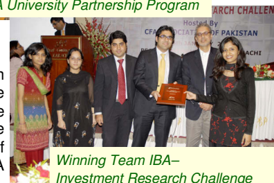
Winning Team IBA— Investment Research Challenge