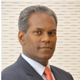
Education & Membership Chair & Asst. Secretary