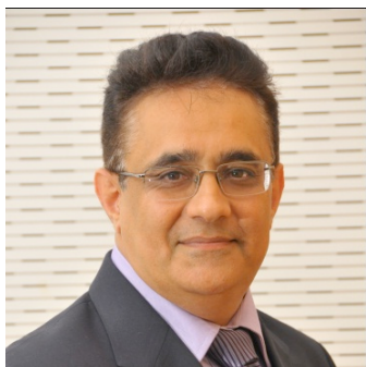
Advocacy Chair & Asst. Treasurer

He joined Capital Asset Management Ltd in 2001 and is currently the Executive Director. (Capital Asset Management Ltd is the Fund Manager of Port Louis Fund Ltd, SME Partnership Fund Ltd and Casino of Mauritius Pension Fund – total assets aggregate to Rs1.7 billion)