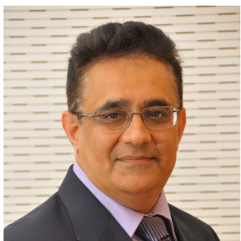
Advocacy Chair & Asst. Treasurer

He joined Capital Asset Management Ltd in 2001 and is currently the Executive Director. (Capital Asset Management Ltd is the Fund Manager of Port Louis Fund Ltd, SME Partnership Fund Ltd and Casino of Mauritius Pension Fund – total assets aggregate to Rs1.7 billion)