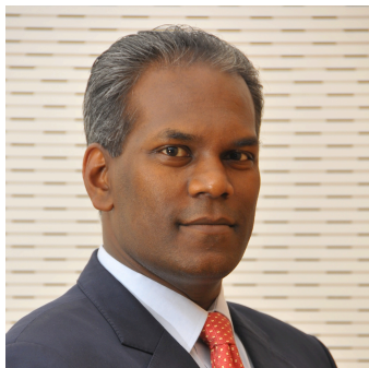
Education & Membership Chair & Asst. Secretary