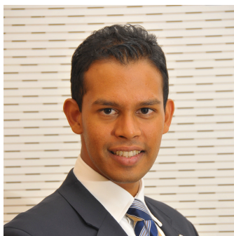
Ex-Asst. Treasurer & Events Chair