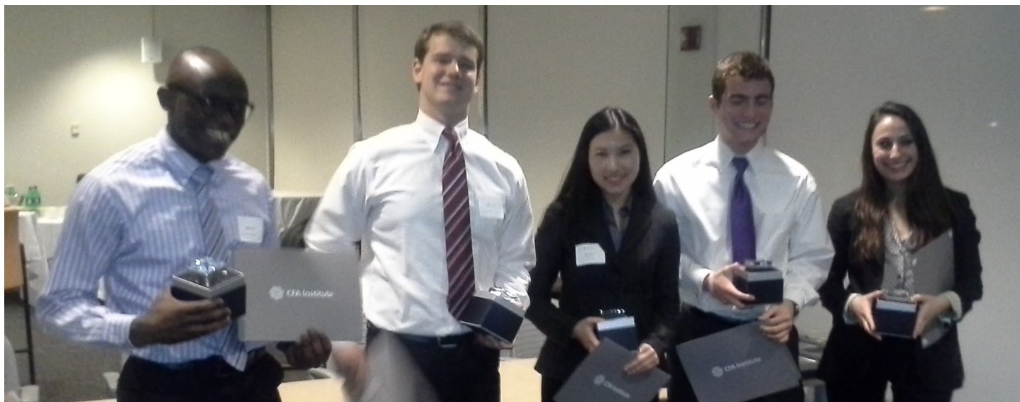
CFA Society Hartford Global Research Challenge at The Hartford Club, January 2014

Annual Meeting New England Air Museum June 12 33 attendees