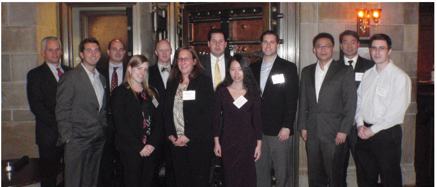
CFA Society Hartford Charterholder Recognition Ceremony at The Society Room, October 2013

The Board welcomes new volunteers willing to share their skills for a single event or for ongoing support. There are many skilled and experienced members in the CFA Society Hartford; we encourage you to become a volunteer and share your skills.