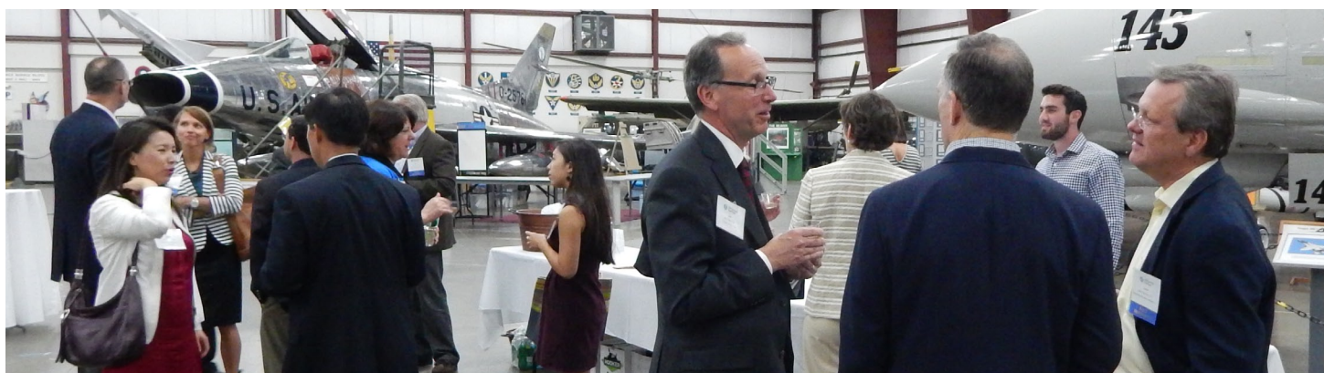
CFA Society Hartford Annual Meeting at New England Air Museum, June 2014