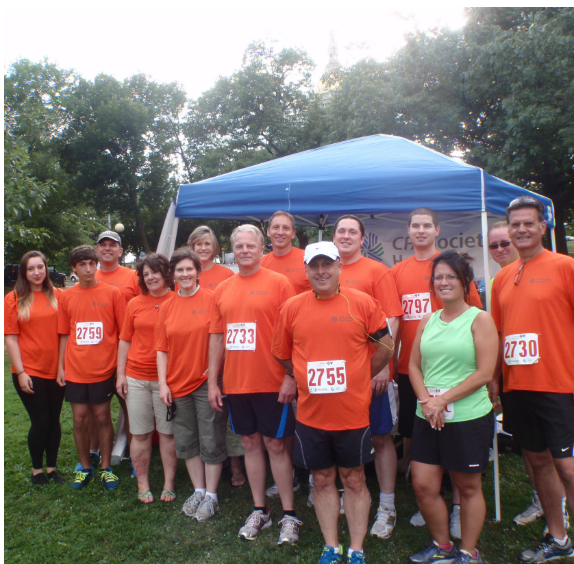
CFA Society Hartford Team, Corporate 5K Race, August 2014

UCONN Business School November 18 49 attendees