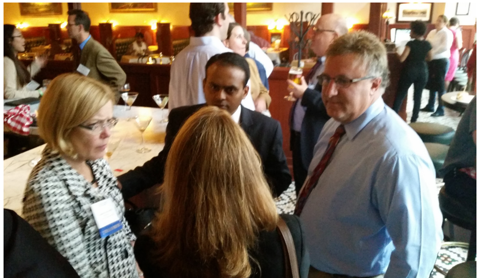
Annual Meeting & Front Street Pub Crawl

May 11 Annual Meeting & Taste of Front Street Front Street, Hartford 27 attendees