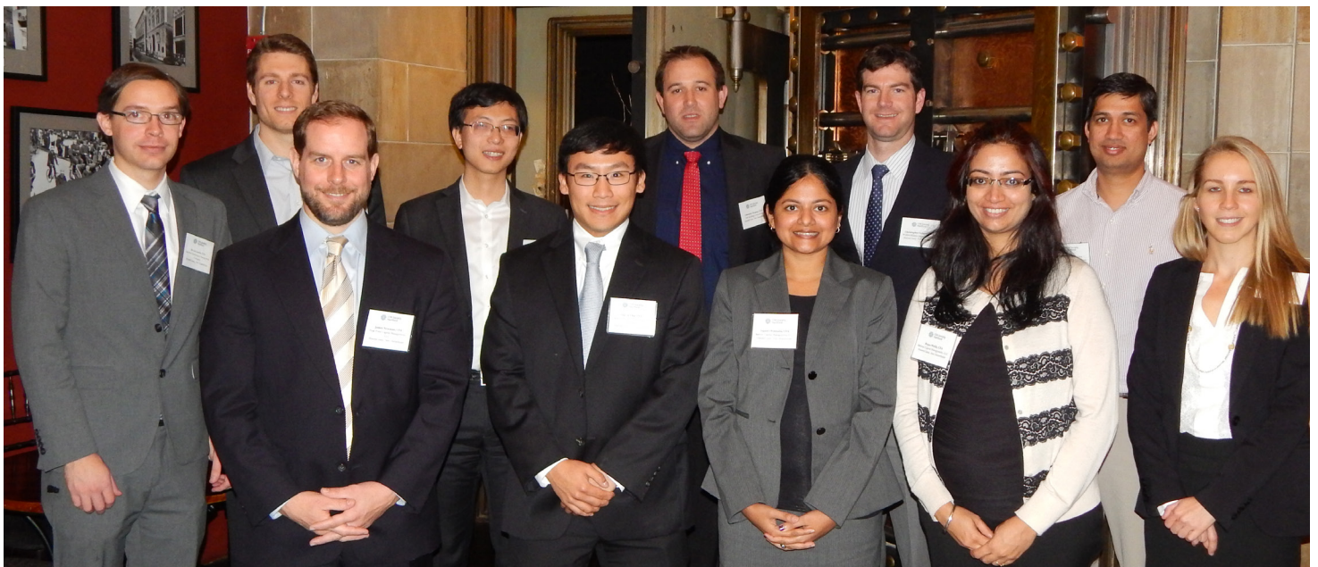
CFA Society Hartford Charterholder Recognition Ceremony at The Society Room, October 2014

The Board plans to hold another comprehensive strategic planning session in 2015.