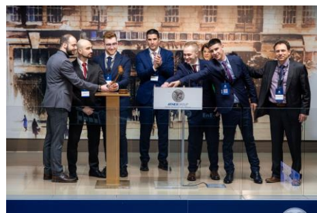
University of Macedonia, Winning Team, rings the opening bell at the Athens Stock Exchange on 14 March, 2023.

Watch the recap of the 2022-2023 competition here.