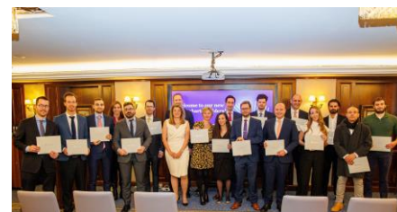
New charterholders, Class of 2023

The 20 th Charter Award Ceremony took place on 11 October 2023, officially welcoming 27 new charterholders (16 were in attendance) to the Greek and Albanian investment communities.