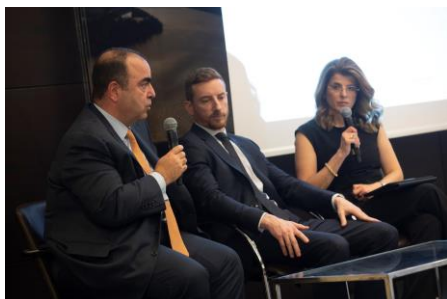
Forecast Dinner panel discussion.

Watch highlights from the Forecast Dinner here.