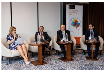
Market Trends panel discussion.

Alternative Investments and ESG Considerations in Traditional Portfolios ( watch the recap here ), as well as two keynote presentations on "Wealth Management Insights: Global Migration Trends for HNWI and the Example of Greece" and "Private Wealth and Sustainable Investing. A Regulator's View."