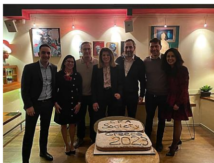
Board and staff at New Year's Party.

In 2023 our members had multiple opportunities to get together, network and celebrate. We hosted two Members Only Networking Drinks, our annual New Year's Party at The Black Duck, Summer Party at Balthazar and Christmas Party at 48 Urban Garden.