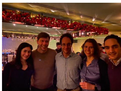
Christmas Party 2022