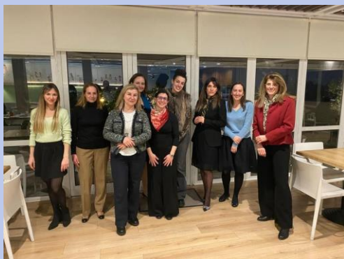
First Women's Circle Meeting.

In an effort to encourage more women to join the finance profession and start the CFA Program, we started our Women's Circle , with the support of Lean In Greece , in March 2022. The Circle allows small groups of women to meet regularly to support each other, and give and get advice.