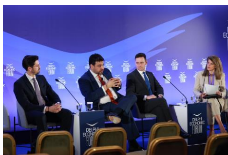
DEF VII panellists and moderator.