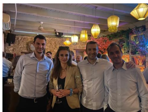
Summer Party 2022

After 2 years of meeting virtually, we were grateful for the opportunity to host three social events for CFA Society Greece's members and candidates. Our Easter and Summer parties were hosted at Balthazar and our Christmas party was hosted at 48 Urban Garden. These social events reminded us of the importance of meeting in person with colleagues and friends.