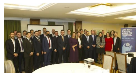
23 new CFA charterholders.

The 19th Charter Award Ceremony took place on 5 December 2022. We celebrated the achievement of 33 new charterholders (23 were in attendance) who earned the CFA charter between October 2021 and November 2022.