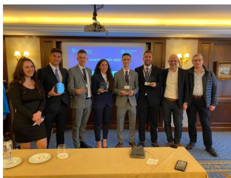
University of Macedonia, Winning Team

The local final of the 2021-2022 Research Challenge with Subject Company Papoutsanis SA was our first in person event following the pandemic. On Saturday, 26 February 2022 the University of Macedonia won the local competition and went on to compete in the EMEA subregional and subsequently the team was one of six to reach the EMEA final, creating important awareness in the region for the university and our Society. Congratulations to the team for their great achievement!