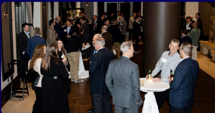
2024 Annual Outlook Dinner