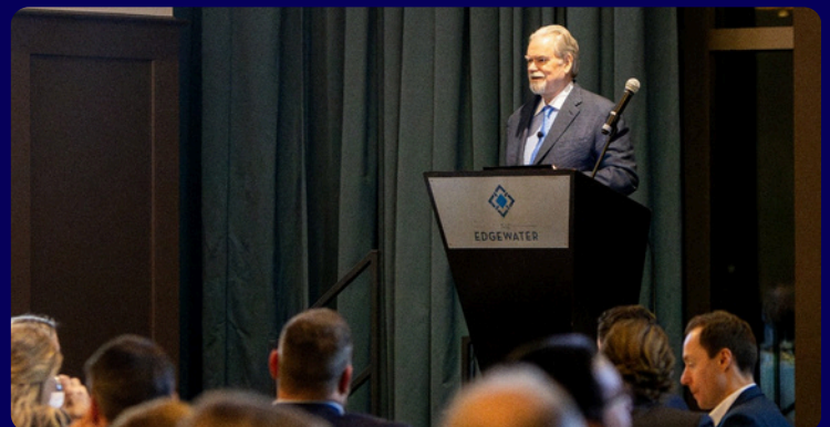
2024 Annual Outlook Dinner