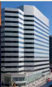
4711 YONGE STREET Owned by Marisa Construction Limited Managed by Menkes Property Management Services Ltd.