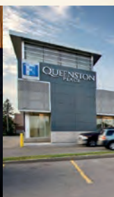
QUEENSTON PLACE Owned by First Capital Realty Inc. Managed by FCR Management Services LP