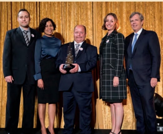
MAPLE GROVE VILLAGE RETAIL

Owned by First Capital Realty Inc. Managed by FCR Management Services LP