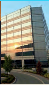
55 COMMERCE VALLEY DRIVE WEST Owned and managed by Northam Realty Advisors Limited