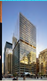
145 KING STREET WEST Owned and managed by QuadReal Property Group