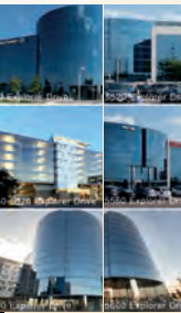
AEROCENTRE Owned by Healthcare of Ontario Pension Plan (HOOPP) Realty Inc. Managed by Menkes Property Management Services Ltd.