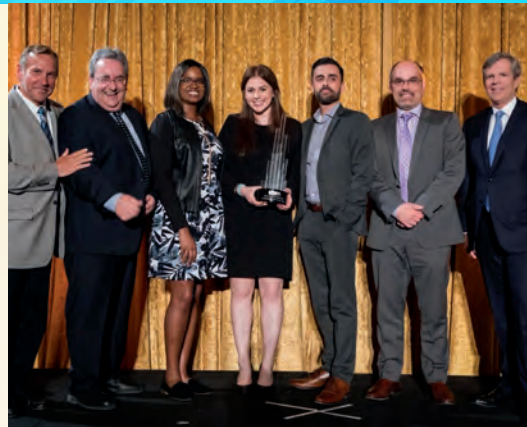
CANADA SQUARE (2200 YONGE STREET) 250,000 – 499,999 SQ. FT.

Owned by OPG Investment Holdings Limited Partnership by its general partner OPG Investment Holdings GP Inc., CT REIT (Yonge Eglinton) Inc., 2180 Yonge (Canada 8) Holdings Limited Managed by Oxford Properties Group