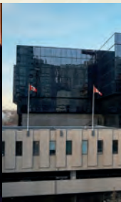
CANADA SQUARE (2190 YONGE STREET) Owned by OPG Investment Holdings Limited Partnership by its general partner OPG Investment Holdings GP Inc., CT REIT (Yonge Eglinton) Inc., 2180 Yonge (Canada 8) Holdings Limited Managed by Oxford Properties Group