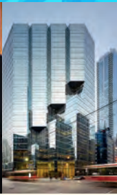
200 KING STREET WEST Owned and managed by QuadReal Property Group