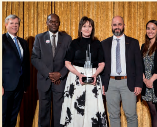
AEROCENTRE SUBURBAN OFFICE PARK

Owned by Healthcare of Ontario Pension Plan (HOOPP) Realty Inc. Managed by Menke Property Management Services Ltd. (Canada 8) Holdings Limited