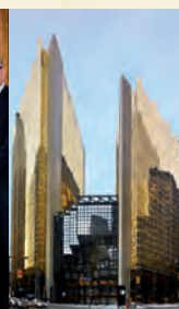
ROYAL BANK PLAZA Owned by CPP Investment Board Real Estate Holdings Inc. & 200 Bay Street Holdings Inc. & Oxford Properties Managed by Oxford Properties Group