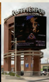
RUTHERFORD MARKETPLACE Owned by First Capital Realty Inc. Managed by FCR Management Services LP