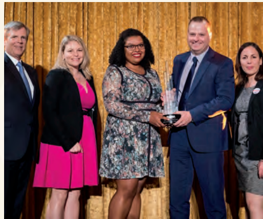
SOUTHCORE FINANCIAL CENTRE OVER 1 MILLION SQ. FT.

Owned by British Columbia Investment Management Corporation Managed by QuadReal Property Group