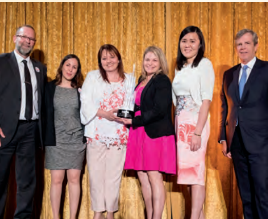
145 KING STREET WEST 500,000 – 1 MILLION SQ. FT.

Owned by OPG Investment Holdings Limited Partnership by its general partner OPG Investment Holdings GP Inc., CT REIT (Yonge Eglinton) Inc., 2180 Yonge (Canada 8) Holdings Limited Managed by Oxford Properties Group