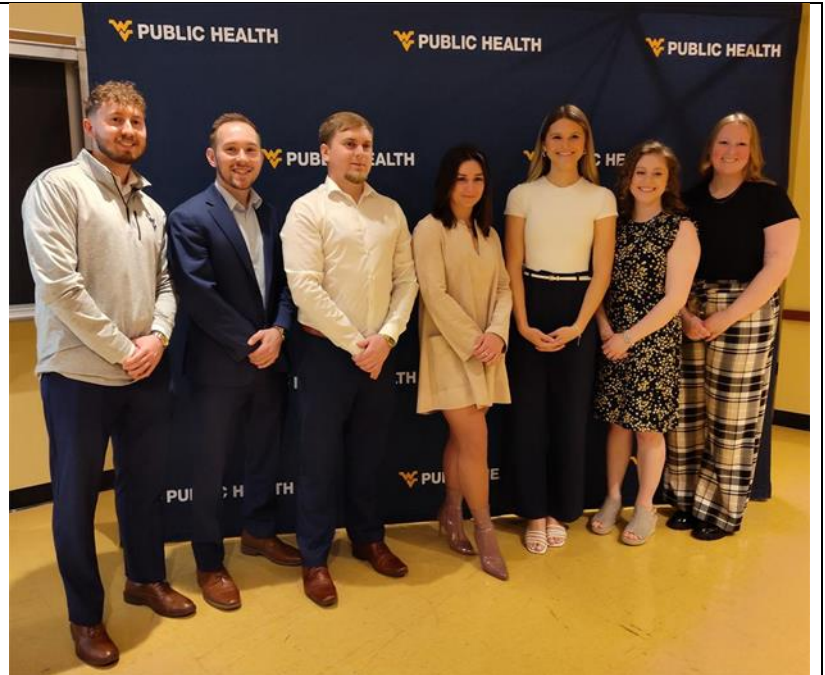
Xavier University This is the 20th year of UPD at Xavier. Photos of the Graduate and Undergraduate induction ceremonies.