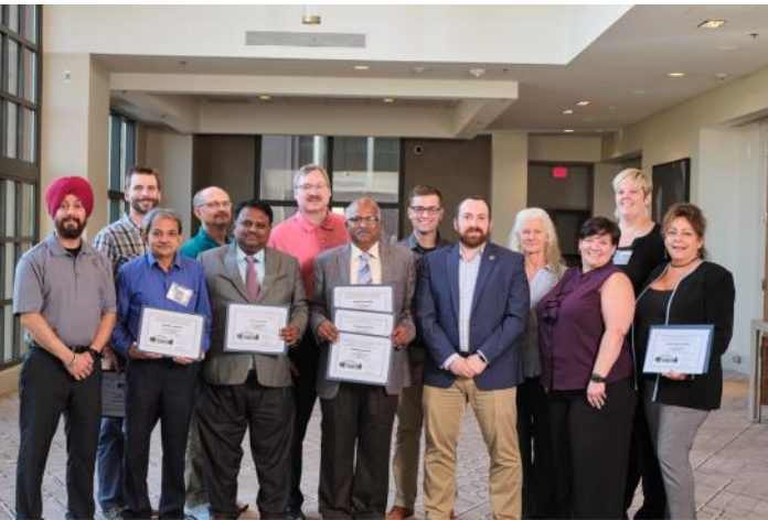
Cleveland Chapter wins Programming Award from ASM International.