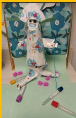
Pat- She has a hard time collecting herself!