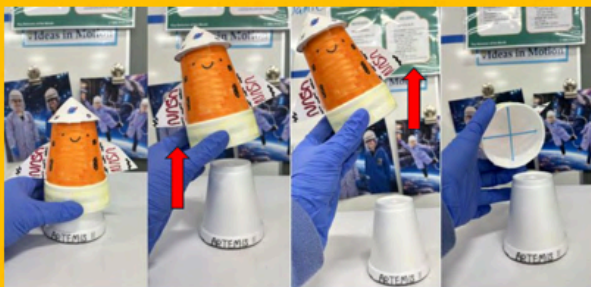
Artemis II- This interactive rocket toy will jump when played with!