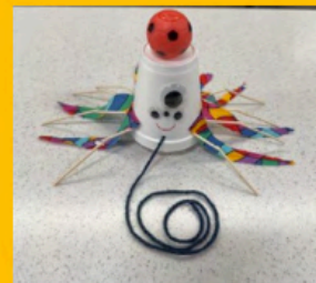
Creepy Crawler- pull the string to make him crawl around!