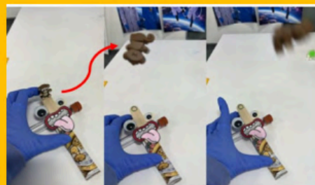
Launchy- It will launch small objects into the sky for a thrilling adventure!