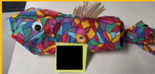
Gill- He is curious, a little chaotic, and way too confident for a fish. He believes he's the smartest member of the lab team even though he doesn't quite understand what's going on half the time.