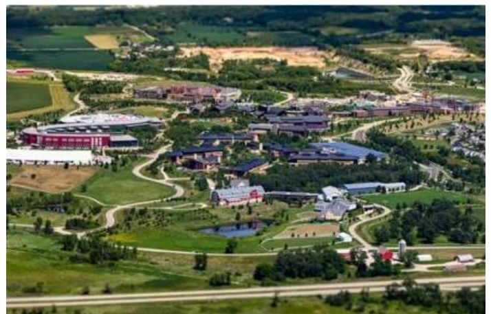
Epic campus, Verona Wisconsin

Below an aerial view of the campus are a few photo's taken during breaks in the conference. Had I not been an MLS, I likely never would have seen any of this.