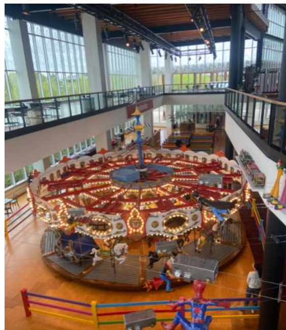
Merry-go-round in the training center