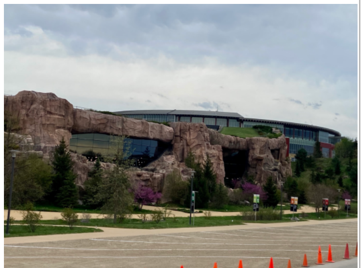
Training Center, Deep Space area