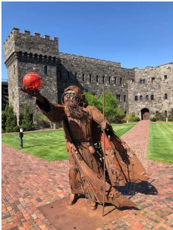
Sculpture in Wizard themed area