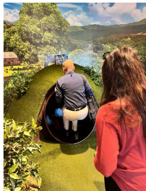
Alice in Wonderland "rabbit hole" option (vs stairs)