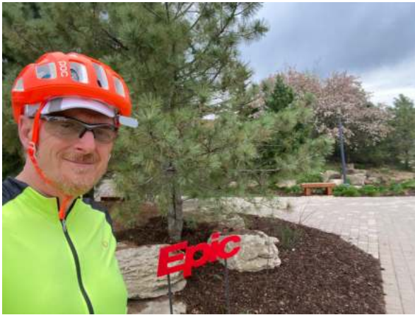
I brought my bike along. Great bike paths all around the Madison region and Epic campus.