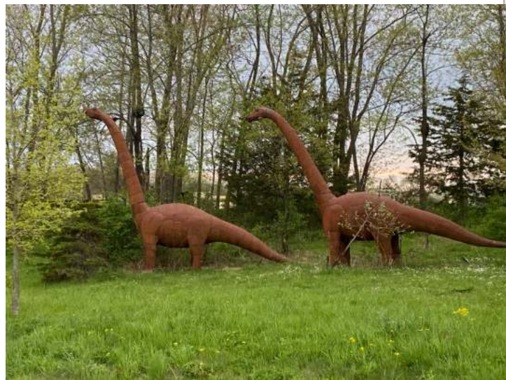
Dinosaur sculptures on campus