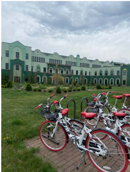
Holstein cow bikes available for use