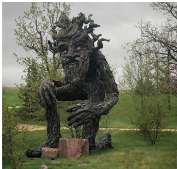
One of many works of art