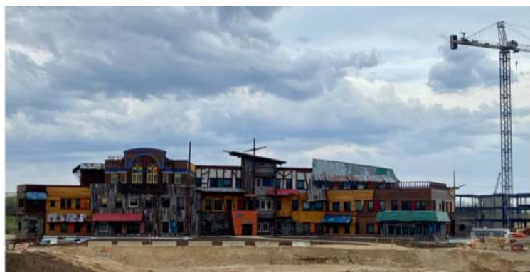
New "Castaways" section under construction