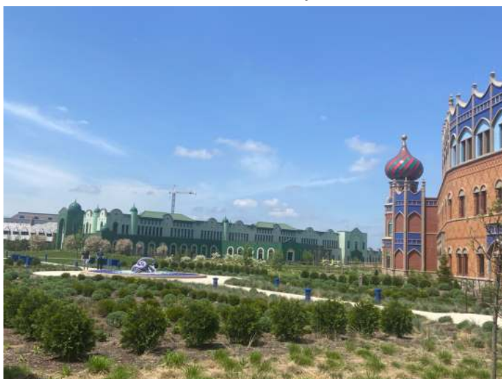
Emerald City/Wizard of Oz section of campus