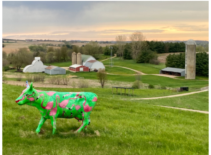
View of original farm maintained on campus