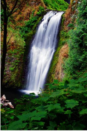
Multnomah Falls East of Portland