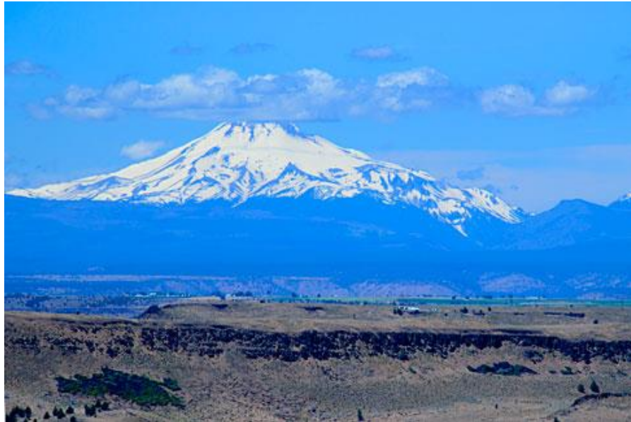
Mount Jefferson, Oregon Cascade Range