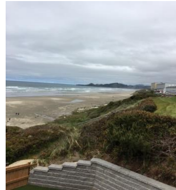
View from the Oregon Spring Seminar venue – Hallmark Hotel, Newport, Oregon

This year’s Spring Seminar event hosted a cocktail hour on Friday night featuring some baked brie and a selection of desserts to munch on, followed by an ASCLS board meeting as well as a deli group lunch on Saturday. As always, the Oregon Spring Seminar was a chance to catch up with old friends, learn something about the profession, and encourage new people to become involved in the professional organization.