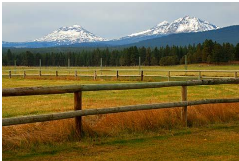
Three Sisters