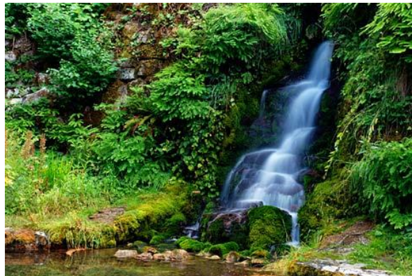
Oregon Caves area, Josephine County