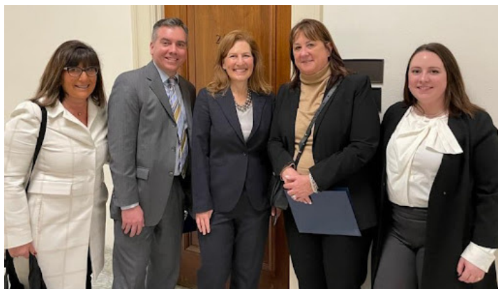
Representative Kim Schrier, MD, (D-WA) (center) meets with National Advocacy Day participants.

On February 28 and March 1, ASCA members representing 31 states attended more than 100 meetings as part of ASCA's National Advocacy Day. Fly-in attendees met with six physicians: Representatives Neal Dunn (R-FL), Mariannette Miller-Meeks (R-IA), Kim Schrier (D-WA) and Brad Wenstrup (R-OH) and Senators Bill Cassidy (R-LA) and John Barrasso (R-WY). Thank you, Drs. Cassidy, Dunn and Wenstrup, for supporting the Outpatient Surgery Quality and Access Act of 2023 .